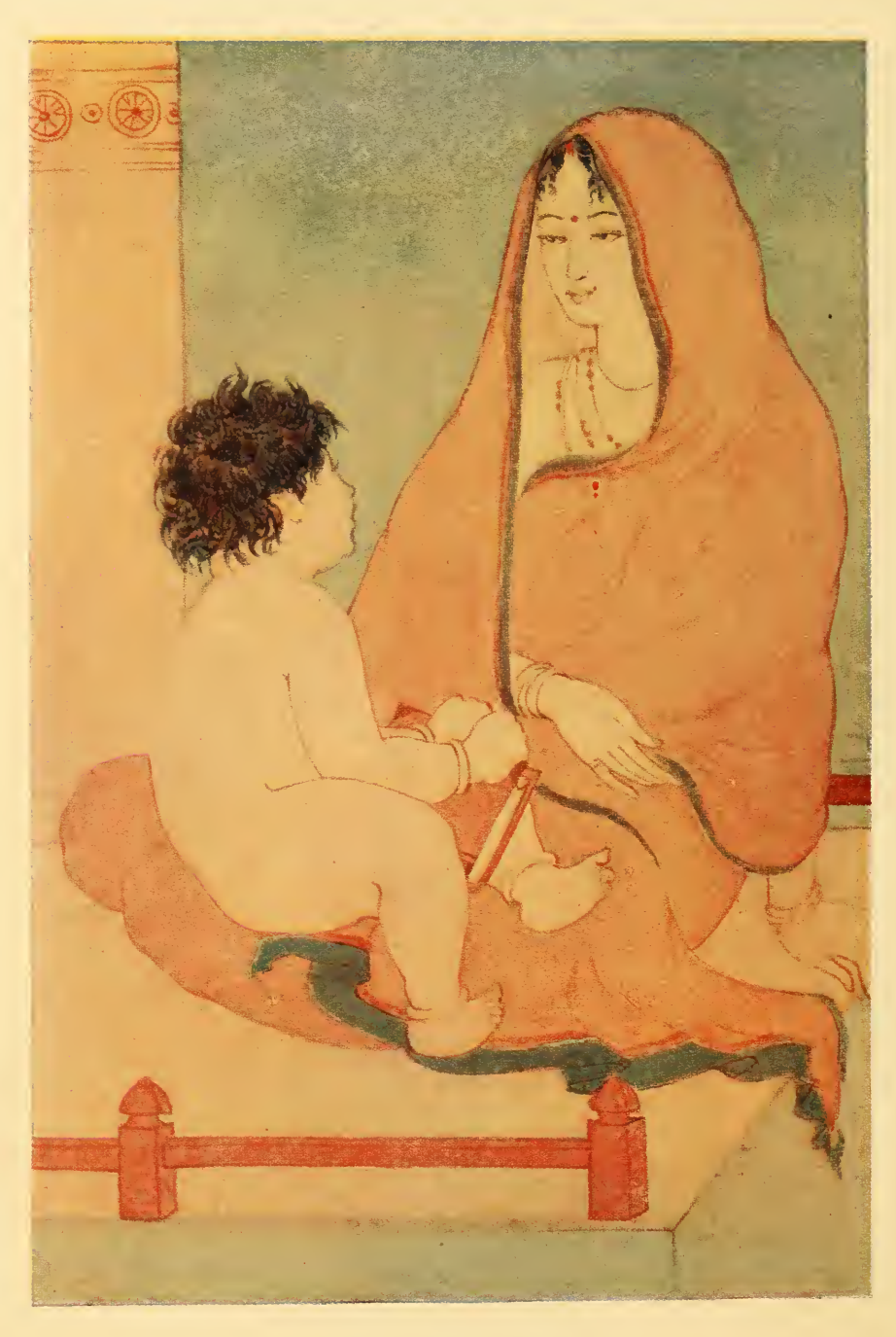
THE BEGINNING. From a drawing by Asit Kumar Haldar.